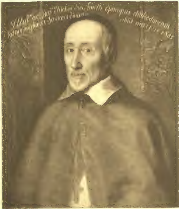
Richard Smith, 1568-1655, Bishop of Chichester Second Vicar Apostolic of England 1625-51 From the original at Louisa Abbey